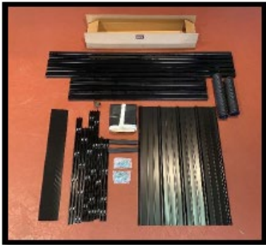
Unpack BannerFrameAir kit

BannerFrameAir can be installed on-site, in-air or in-advance as-shown below.assembled as shown.