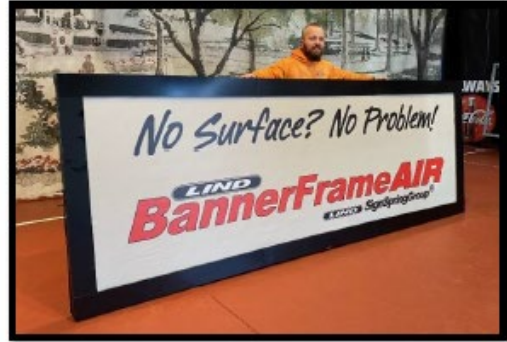
Install vinyl and transport to job site for easy installation